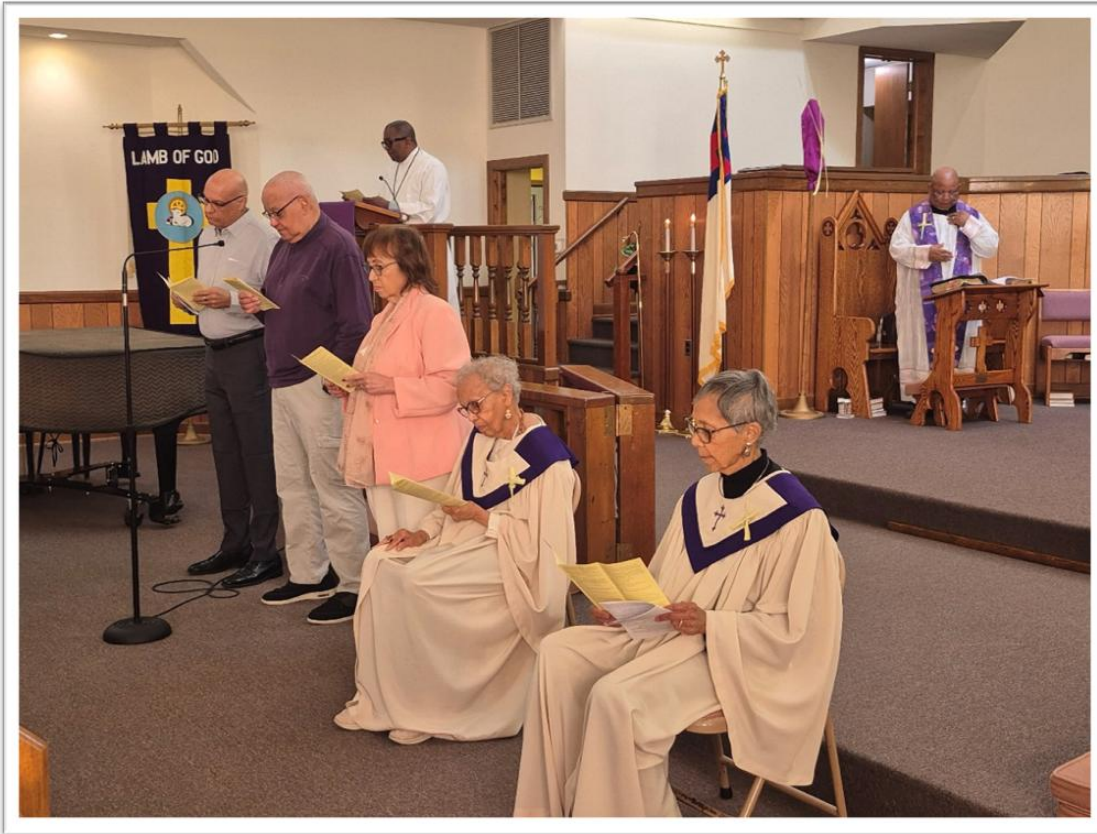
St. Cyprian's parishioners were asked to re-enact The “Passion” Narrative.